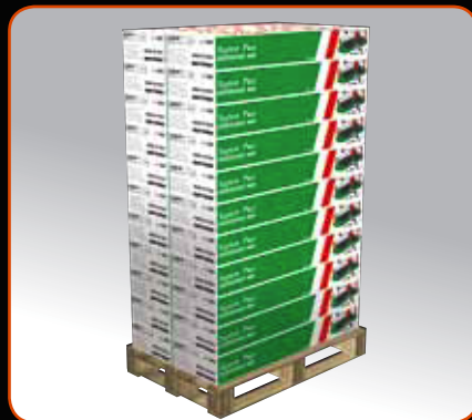
PACKAGING Multilingual flexographed packaging.