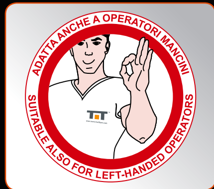
LEFT-HANDED OPERATORS Suitable also for left-handed operators.